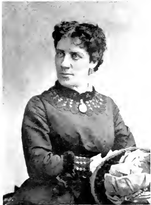
ANNA ELIZABETH DICKINSON.

and in Philadelphia. From that time till the end of the Civil War she spoke on war issues. In 1863 she was engaged to deliver a series of addresses, in the gubernatorial campaign, throughout the coal regions, as the male orators were afraid to enter those regions so soon after the draft riots. On 16th January, 1864, she spoke in Washington, D. C., and donated the proceeds, over $1,000, to the Freedmen's Relief Society. She delivered many addresses in camps and hospitals. After the war-echoes ceased, she spoke from the lyceum platform chiefly, her lectures being on "Reconstruction" and "Woman's Work and Wages." In 1869 she visited Utah, and afterward she lectured on "Whited Sepulchres," referring to Mormonism. Her subsequent lectures were "Demagogues and Workmen," "Joan of Arc," and "Between Us Be Truth," the last-named devoted to Missouri and Pennsylvania, in 1873, where obnoxious social evil bills were up for discussion. In 1876 Miss Dickin-